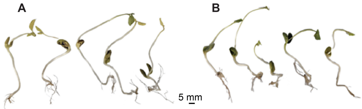
Figure 3. Soybean seedlings at the unrolled unifoliate leaves stage under cold stress. (A) Seedlings derived from magnetic field-treated seeds; (B) seedlings derived from non-magnetic field-treated seeds.