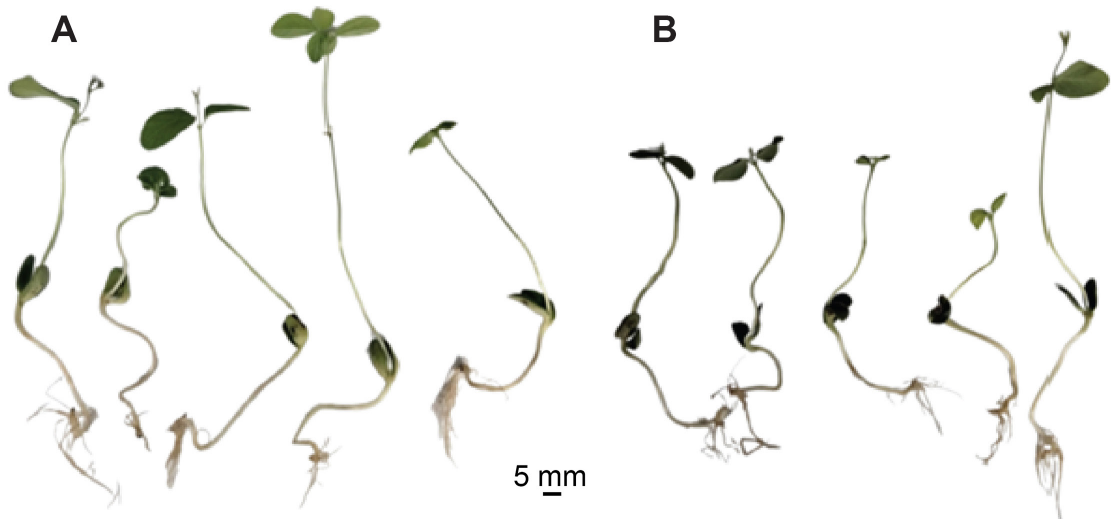
Figure 4. Soybean plants at the first trifoliate stage under cold stress. (A) Plants derived from magnetic field treatment; (B) plants derived from non-magnetic field treatment.